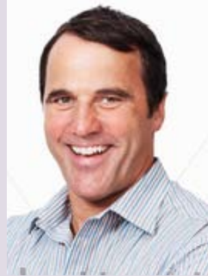
A. CLOUD Chief Security Officer Enabler of cloud adoption