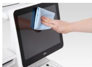
Fine-view, full-flat LCD for easier cleaning