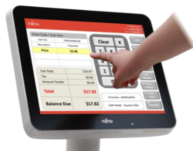
Shockproof, waterproof, and dustproof full-flat LCD (IP53)