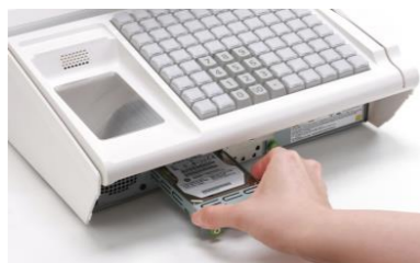
Front-accessible SSD for convenient maintenance