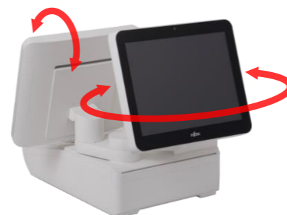
Flexible double arms (swivel, tilt, and slide adjustable)