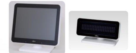
Remote Type LCD