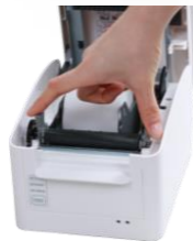
High performance printer featuring convenient tool-free maintenance