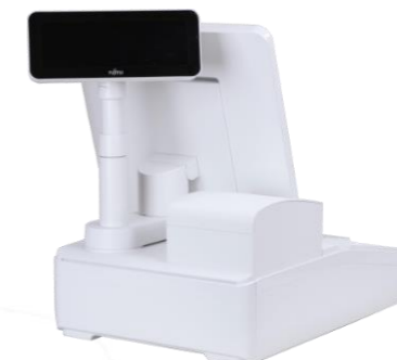
Minimized cabling that frees up counter space