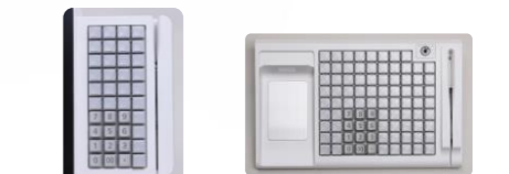
TeamKey with MSR (40 keys)