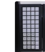
TeamKey with MSR (40 keys)