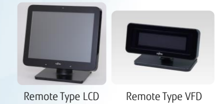
Remote Type LCD