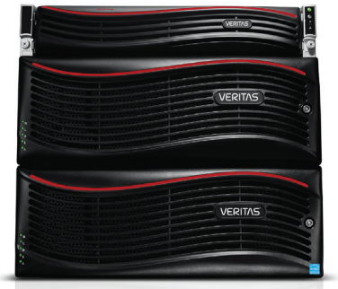
NetBackup 5330 Appliance

The NetBackup 5330 is offered in a High Availability (HA) configuration. The HA configuration increases system reliability, provides higher backup and recovery throughput as well as higher operational availability at significantly lower operational costs.