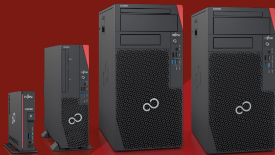
G9010 D9011 P9011 P9910