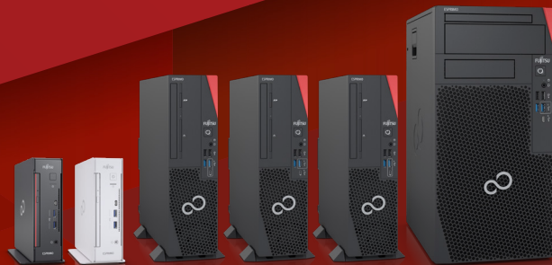
Q7010 Q7010 D6011 D7011 D7010/8 P7011