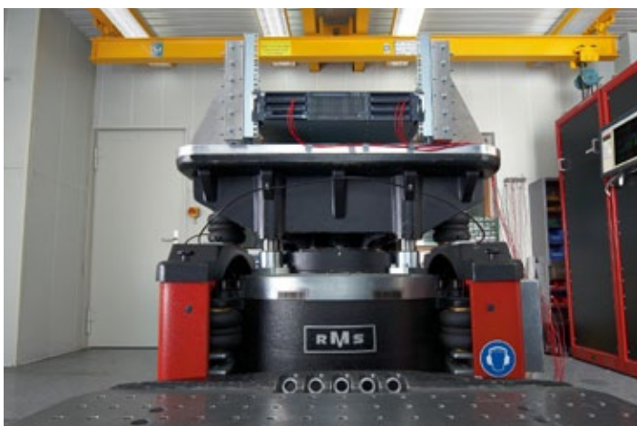
Good vibrations: At the Augsburg Test Center servers must withstand vibration testing

“With our ETERNUS DX system, NetApp V series takes over storage virtualization and is part of a highly-available metrocluster configuration,” clarifies Daniel Gull, who is an IT architect and was in charge of the project planning. “Along with the enhancement of performance through caching a series of cost-saving functions are available via the deployment of NetApp ONTAP software.” Some examples of these are SnapShots, SnapClones, SnapMirror and data deduplication. The NetApp solution also provides the possibility to connect to more storage systems, if need be, and in turn to consolidate these capacities into one virtualized storage pool.