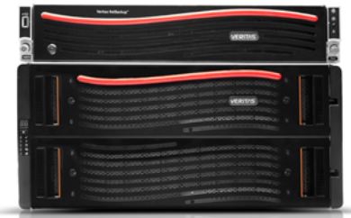
NetBackup 5340 Appliance

The NetBackup 5340 is offered in a High Availability (HA) configuration. The HA configuration increases system reliability, provides higher backup and recovery throughput as well as higher operational availability at significantly lower operational costs.