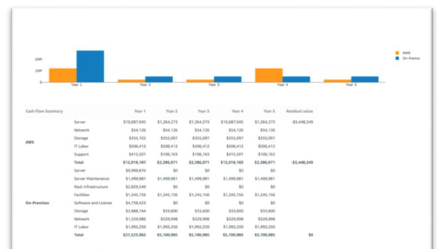
On premise vs AWS Cloud Cashflow

To find out more about kick-starting your AWS transition, contact us at