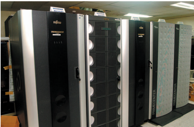
As DB servers for the hospital's key system, Yongdong Severance Hospital is using two Fujitsu PRIMEQUEST servers with Intel® Itanium® processors. By applying a clustered configuration, the hospital has maximized the usability of the system.

Since operation of 'U-Severance' commenced in July 2006, system failure time is 'zero' while enjoying benefits such as swift service