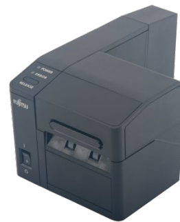
Product No. KD04107-A001 (Without LCD)