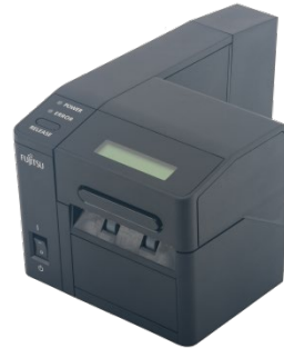
Product No. KD04107-A011 (With LCD)