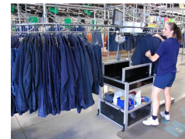
Laundry factory introduced the system

This solution service tracks all the processes from accepting used clothes / linens until shipping cleaned clothes. The batch reading of linen tags can help realize efficient operation and automatic production lines in laundry factories. And, it can not only reduce wasteful costs and energy which have ever been consumed, but lead to the effective use of resources, thanks to repeated use of the small and durable linen tags.