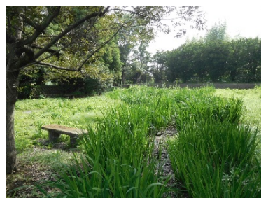
Small river in the biotope