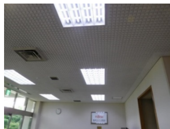
LED lightings at the front lobby

Kumagaya SSC has been taking actions on the environmental activities, ever since Fujitsu operated. For example, as one of the energy saving measures, totally more than 3,000 LED lightings have been introduced within the site, which can reduce electricity consumptions of approximately 370 MWh per year, since starting the replacement in 2012.