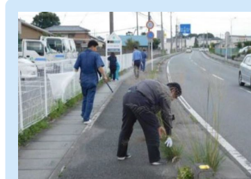
Pick-up of trash