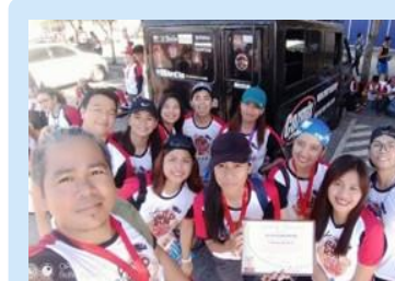
After the event