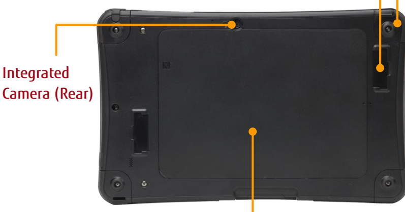
Eight hours continuous operation.