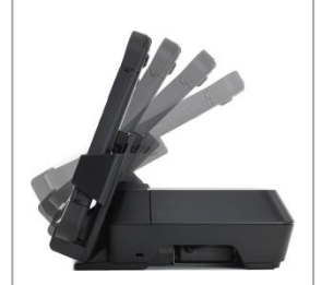
Four angle adjustment