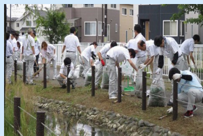
Scene of weeding (June 7, 2017)