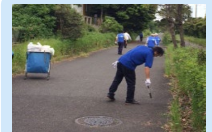
Pick-up of trash (May 12, 2017)