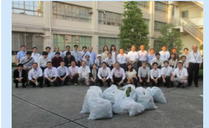
Environmental Month (June 14, 2017)