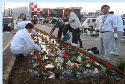
Flower planting (April 27, 2017)