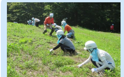
Weeding in the forest (July 8, 2017)