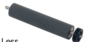
Platen Roller (General) Coated Platen Roller for Liner Less