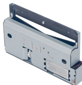
Cutter Unit (General) Cutter Unit for Liner Less