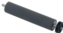
Platen Roller (General)