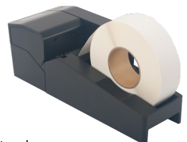
Roll Stand Option for Baggage Tag