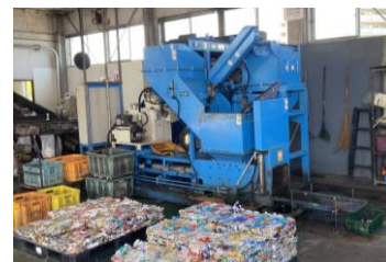
A scene of on-site audit