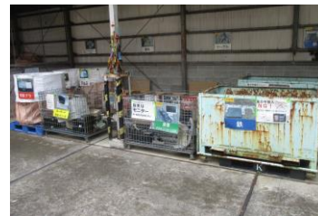
Small sorting (HQs / Tokyo Plant)

In addition, we periodically conduct on-site audits against industrial waste vendors so as to see if the waste we consigned vendors is processed properly, by utilizing a representative audit framework in Fujitsu Group (if multiple sites in the Group have contracts with the same waste vendor, then a representative site conducts on-site audits as a representative).