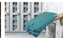
•Medical uniform management solution