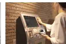
•Cashless / ticketless betting system