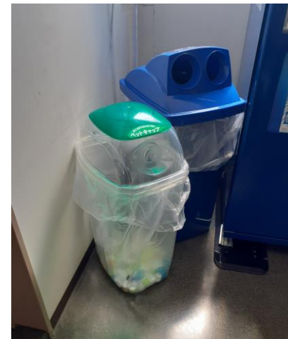
A box to collect caps within a facility