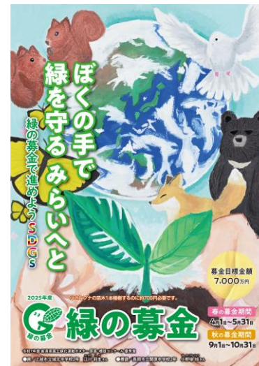
Poster of "Green Fund"