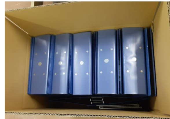
Tube files before donation