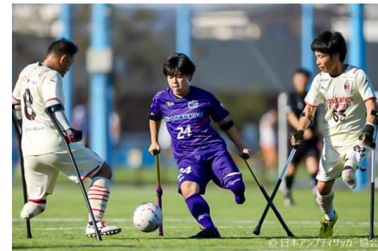
Amputee Football play