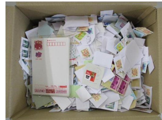
Collected postal stamps, etc.