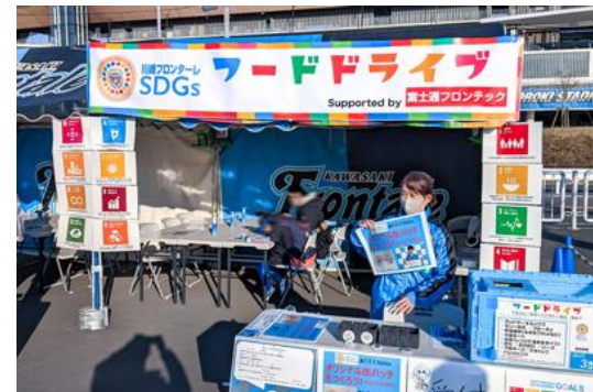
Kawasaki Frontale SDGs food drive Booth