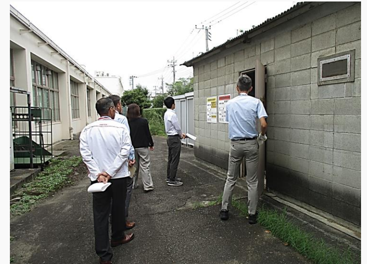
A scene of Fujitsu Group Integrated Internal Audits

Incidentally, we have no non-conformity in the audits of FY2024.