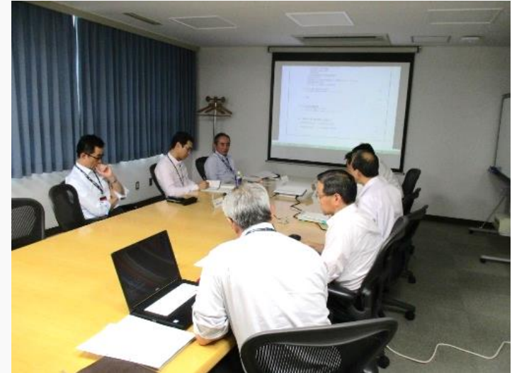
Environmental Business Committee

In FY2025, we have restructured our environmental organization accompanied by our business restructuring in April 2025, and we promote EMS activities, together with Fujitsu Frontech Systems Limited which became a wholly-owned subsidiary of Fujitsu Limited.