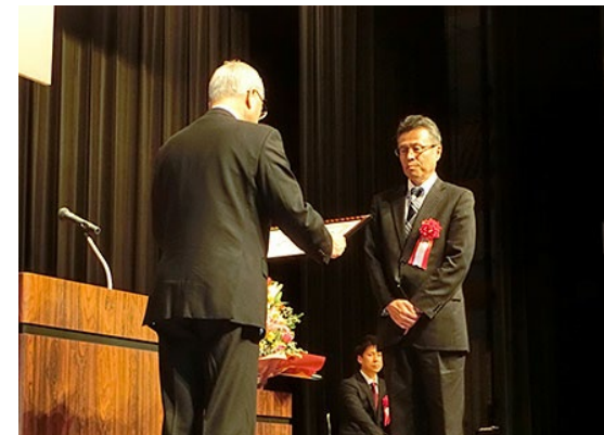
Award ceremony at "Forum Kumagaya 2019"