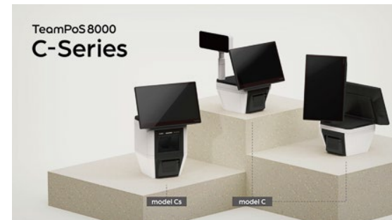
TeamPoS8000 C Series (Model C, Model Cs)

➤ Website of Good Design Award:Good Design Award 2024 - TeamPoS 8000C Series (Models C and Cs) Introduction Page