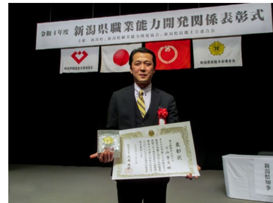
Award ceremony for the Master Craftsman of Niigata

➤ Website of Niigata Prefecture: The Master Craftsman of Niigata for the outstanding skills, and Person of Merit in the Skill Test were awarded in 2022. (Japanese text only)