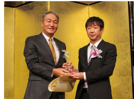
Award ceremony at "Data management 2024"