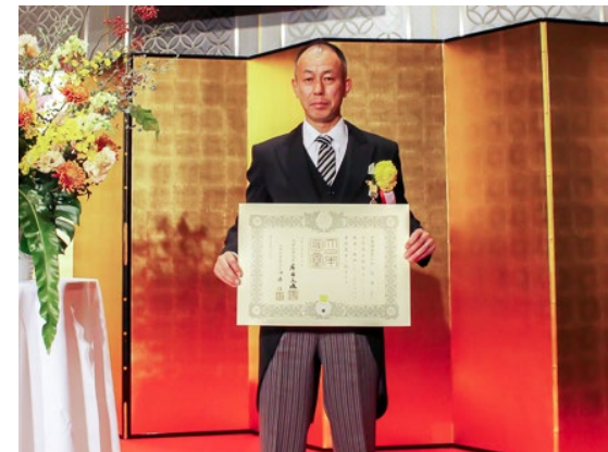
Award Ceremony of 2023 Autumn Conferment

➤ Website of Ministry of Health, Labour and Welfare: About the 2023 Autumn Conferment (Japanese text only)