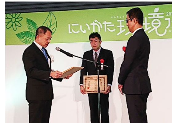
Award ceremony at "Niigata Environmental Festival 2019"

➢ Website of Niigata Prefecture: "Awarded Business Facilities of Eco Business Facility Award" (Japanese text only)