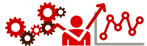
Surge in data analytics

The data can then be shared with the community, enabling wider participation in the process of setting priorities.