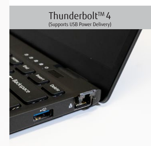
Full-size Flip LAN Port