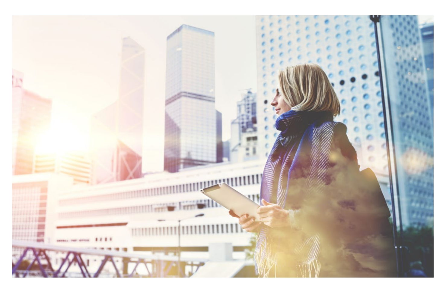
3. Starting Today, AI Will Power Businesses Into The Future, a commissioned study conducted by Forrester Consulting on behalf of Fujitsu, May 2020.

At the other end, Ant Financial – a subsidiary of Chinese internet giant Alibaba – is using Al to assess simple auto-insurance claims in just six seconds based on smartphone photos sent by the customer. By comparison, humans take an average of 6 minutes, 48 seconds, with the same information.