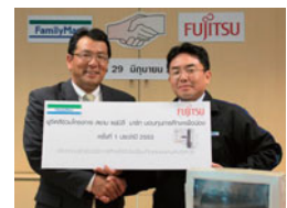
Donating PCs to the "Youth and Education" Project

Fujitsu System Business Thailand (FSBT), an ICT solution company in Thailand, joined hands with Siam Family Mart, operating a chain of convenience stores in Thailand, in the project initiative entitled 'Youth and Education' in June 2010. In this project, FSBT donated 12 PCs to rural schools for the purpose of supporting education program.