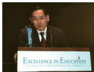
Speech at the Awards Ceremony

These activities have been widely praised, and in April 2011, FNC was awarded Richardson Independent School District's excellence in leadership prize, the highest award given to a corporation for contribution to the community.