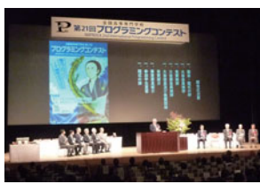
Technical college 21st Programming Contest

In November 2010, Fujitsu invited the winning team to its Kawasaki research and manufacturing facilities. In addition to presentation and demonstration by them, we arranged discussions with a variety of Fujitsu employees, including engineers from the technology division. The students were forthcoming with technical question concerning development efforts at the site, project