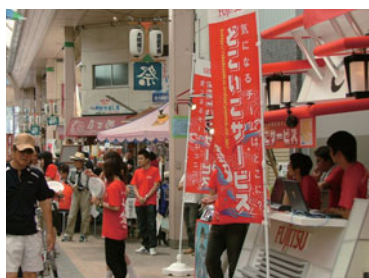
Introducing the Dokoiko Service at the Yosakoi Festival

The "Dokoiko Service" provides real time information about crowding at the event stages and dancing spots over the internet. It enables the dancers to see where they can dance at minimum waiting time. Based on the information, they decide their route and apply for the performance so that they can dance at more stages. On the other hand, visitors can check the performance schedule on the website, and get to the stages prior to their favorite dancers' arrival. Thus, the Dokoiko System contributes to