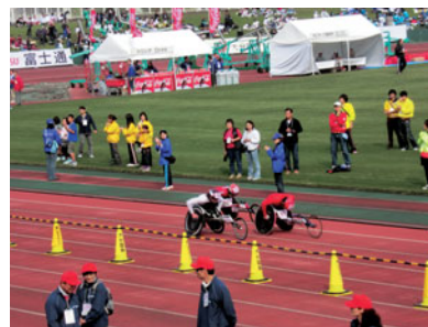
30th Oita International Wheelchair Marathon

Fujitsu continues to encourage employees taking on challenges by supporting those who work in various fields at the same time as they are participating in American football, track and field, and women's basketball teams.