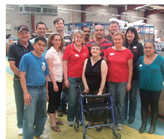
Employees who participated in volunteer work

The purpose of the activity was to help challenged persons exert their abilities through the work. However, it also became a valuable opportunity for FANZ employees to recognize the importance of local communities.