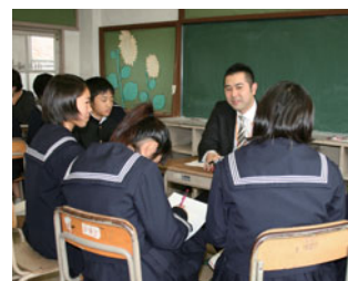
A career education program at a junior high school

Fujitsu Design Limited provides mobile-phone design workplace experiences at their Kawasaki research and manufacturing facilities. The Group also participates in a program that delivers classes to students as part of an NPO-sponsored career education program. Thus Fujitsu works proactively in education support activities and continues to support local career education.