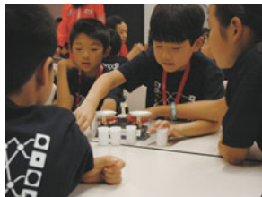
Fujitsu Kids Event 2010

The event had two parts. In the first, entitled "Let's have fun learning about computers!" after trying to sort a variety of data in a group project, the children learned about the mechanism by which multiple computers process data in parallel by walking around a picture painted on the ground. In the second part, "Let's find Fujitsu technology!" the children visited "Fujitsu Technology Hall," where many products such as supercomputers and their applications, self checkout systems, and undersea cables are displayed, and learned how the mechanisms they had studied are used in actual products.