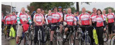
FTEL employees who participated in the charity bicycle run

FTEL raised GBP 7,500 (about one million JPY) for BHF by this charity run.