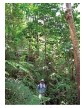
Dipterocarpaceae that have Grown to a Height of 6 Meters

Together with Advantest, which has been cooperating in reforestation since fiscal 2005, Fujitsu carried out a study of the state of the planted seedlings. Since the reforestation site is almost directly under the equator at 6 degrees north