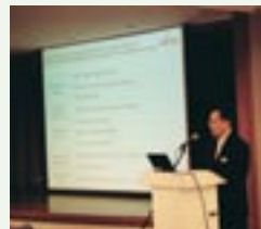
Environmental Forum in Singapore

At the same time as the EMS meeting in Singapore, we took the opportunity to exhibit at the Eco-Products International Fair 2006 in Singapore for the first time as the