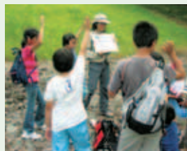
Nature School at the Numazu Plant

At our Numazu Plant, we are preserving the natural environment as an "industrial park" under an innovative concept that includes retaining the natural woods and tea plantations that were present before the factory was opened. Taking advantage of the natural environment within the plant complex, we created a "Nature Appreciation Academy" to provide hands-on environmental education for our employees and local community residents. In this effort we worked together with the Whole Earth Institute, an NPO in Shizuoka Prefecture, to carry out a survey of flora and fauna at the site and incorporate the results in constructing a hands-on environmental education program for each season and training environmental interpreters (nature observation guides). In addition to organizing nature observation events for employees of the Numazu Plant and their families, we also hold nature observation instructor seminars for those in charge of EMS activity promotion at each of our factories. In the future, we plan to implement programs and hands-on events for employees, local residents, and visitors to our plants, and to promote environmental learning extensively.