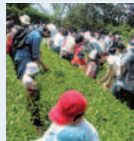
Numazu Plant Tea Picking Festival