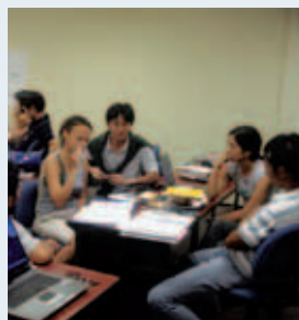
Group study session (JAIMS)