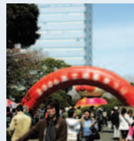
Kawasaki Plant Spring Festival