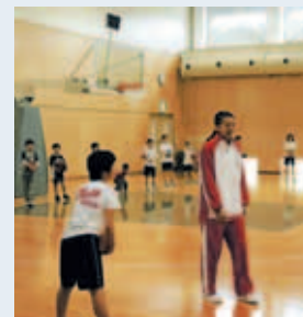
Local exchange with Fujitsu women's basketball club