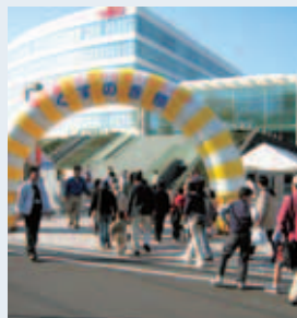
Fujitsu Solution Square Kusunoki Festival