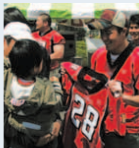
Local exchange with Fujitsu American football club