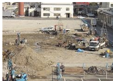
Conducting a soil drilling study (Fujitsu Kawasaki Plant)

We also investigated the sites where buildings had been dismantled, moreover, and sealed all areas where contamination had occurred with seepage-proof pavement. We intend to decontaminate the polluted areas in fiscal 2003. We have conducted ongoing purification of volatile organic compounds, meanwhile, and are in the process of determining a target date for completion of this process. We also explained the regulations and future responses presented in the Soil Pollution Countermeasures Law to each Fujitsu site and affiliated company in May 2002 and February 2003 to obtain their full understanding of its contents and to ensure observance of the law and complete, proper management of hazardous materials.