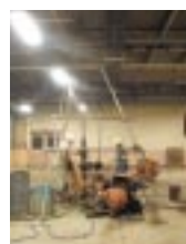
Fujitsu Kanuma Plant