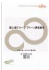
Green Procurement Criteria