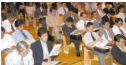
A Green Procurement criteria explanation meeting in progress (Fujitsu Kawasaki Plant)

We investigated our suppliers' environmental responsiveness by means of the Fujitsu Group's unified survey form and requested those who were encountering difficulties in constructing an environmental management system in compliance with international standards to develop and implement an environmental management system determined by the Fujitsu Group. We held a total of 21 explanation meetings in connection with this request with the participation of 920 suppliers, including suppliers to Group companies. With the addition of individualized support for suppliers, moreover, we achieved a value of eco-friendly items as a proportion of all product parts and materials procured exceeding 99.4% as of the end of fiscal 2002.