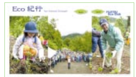
The Eco Travel homepage

* We would like to take this opportunity to thank all those who cooperated in the coverage.