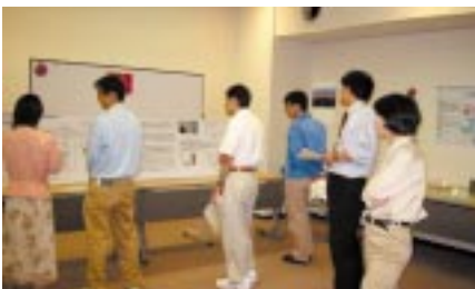
An environmental exhibition corner (Fujitsu Laboratories Atsugi Area)

Fujitsu Laboratories Atsugi Area held an exhibition of advanced environmental R&D projects, including exhibits of biodegradable plastics and halogen-free printed circuit board materials. Some 100 visitors attended the exhibition.