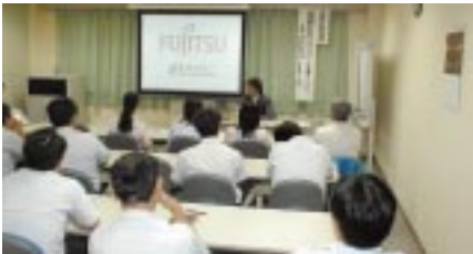
An environmental lecture in progress (Fujitsu Wireless Systems)

Speakers from both inside and outside the company presented 20 lectures concerning environmental issues to audiences totaling 927 employees in fiscal 2002. The photo shows a lecture on zero waste emission.