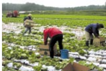
A hands-on experience in organic farming (Kitasaku Horticulture)

A number of employees and their families participated in an agricultural experience event at Kitasaku Horticulture, an organic farm in Nagano Prefecture which has introduced fertilizer recycled from kitchen waste generated by our cafeterias. The event enabled them to experience on-site production of vegetables, which they had often eaten, generally without paying much attention, in the employee cafeteria. The activities included harvesting fresh organic lettuce.