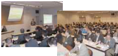
A Green Procurement criteria explanation meeting (Fujitsu Kawasaki Plant)