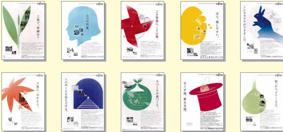
Nikkan Kogyo Shimbun newspaper in August 28, 2001.

This series of press advertisements appeared in the Nihon Keizai Shimbun newspaper between May 2001 and March 2002.