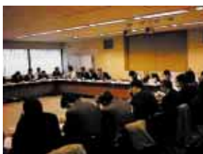
Domestic Affiliated Companies' Environmental Protection Council

This is comprised of executives with environmental responsibility from 36 affiliates, primarily Japanese consolidated manufacturing subsidiaries. In order to promote environmental activities by the Fujitsu Group as a whole, the council meets to discuss and approve implementation proposals for the environmental protection program (meetings: 2 in fiscal 2001, 18 overall).