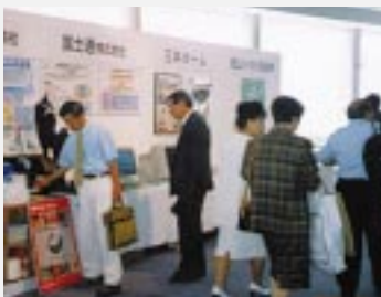
The 55th National Convention of the Japan UNESCO Movement in Okayama