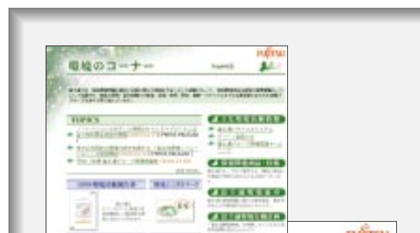
Home Page "Environmental Information" (Japanese version)