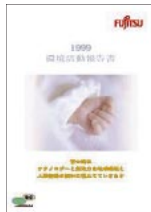
1999 Environmental Activity Report (Japanese version)

http://www.fujitsu.co.jp/hypertext/About_fujitsu/environment/Index-e.html