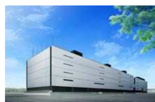
Data center (Tatebayashi)

The Technology Solutions segment provides corporate customers around the globe with IT-driven business solutions based on our advanced technology and high-quality system platforms and services.