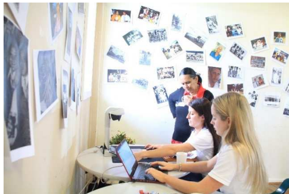
Scanning process for the digital library

Fujitsu Australia supports Bawurra Foundation which works with many Indigenous communities and Elders to preserve Aboriginal and Torres Strait Islander knowledge and culture. This includes digitally preserving artefacts such as maps, photos, letters and news clippings. In 2019, Fujitsu provided the foundation for this digital initiative, with our ScanSnap technology, hosted in our cloud. Fujitsu ScanSnap allows volunteers and community members to scan multiple items at once at very high quality, preserving these as part of the Bawurra Digital library. The library has reached over 1,300 students in 12 remote communities within Australia. The success of the Bawurra Foundation project encourages active learning to share knowledge of First Nations' cultural values, practices and philosophies.