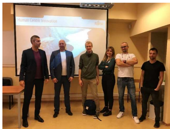
Participants of the program

In addition, the employees in Poland set up a team with the objective to encourage their children to do something positive for the community, environment and their own wellbeing, while developing a positive volunteering attitude. Their activities mainly focus on educational events, including a hardware class to learn how computers work, an Internet Safety workshop, and "Soroban" (Japanese traditional abacus) classes to improve their math's skills.