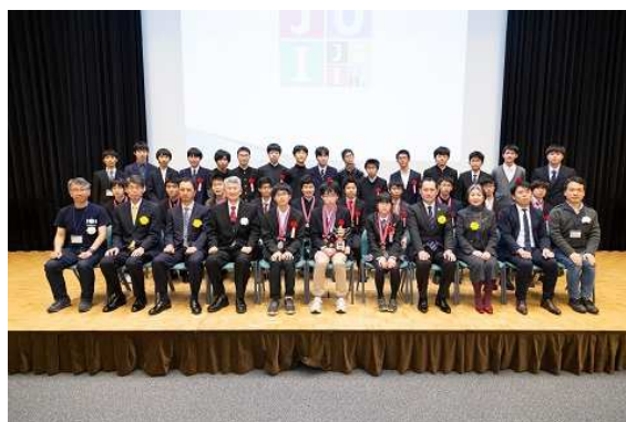
The 18th International Olympiad in Informatics awards ceremony

Meanwhile, the Japanese Committee for the International Olympiad in Informatics was established in 2005 to train human resources in support of Japan's mathematics and information science sector. It provides support for participants of the International Olympiad in Informatics (IOI), a programming contest for junior and senior high school students. As a supporting member, Fujitsu provides assistance in the committee's operation.