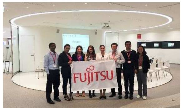
Fujitsu Scholarship Recipients