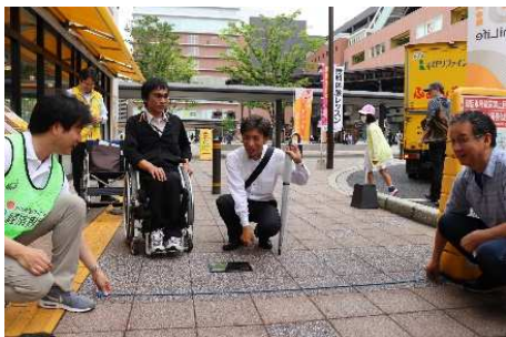
Scene of the field survey