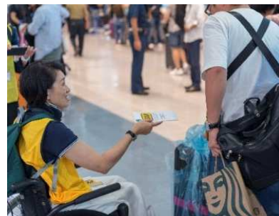
Scene of the distribution