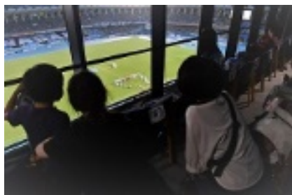
Watching a game in a sensory room

Fujitsu works to achieve "Barrier-free minds" by supporting the creation of children's diaries using ICT and by holding simulated experiences of children with developmental disabilities by spectators as well as being involved in the planning and management. Fujitsu will continue to promote "Barrier-free minds" through sports in cooperation with the J.League, other sports-related organizations, and local governments.