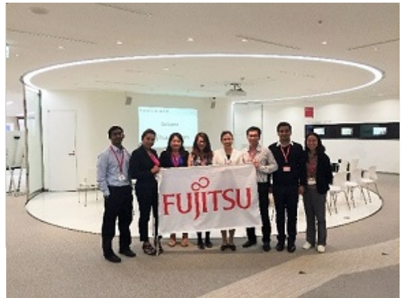
Fujitsu Scholarship Recipients

Fujitsu is working with Fujitsu Group companies doing business in the Asia-Pacific region to provide scholarships to people considering helping their country or community, and contribute to society by providing education rooted in local communities worldwide, aimed at developing business leaders and promoting cultural exchange and mutual understanding.