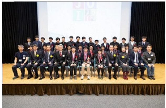
The 18th International Olympiad in Informatics awards ceremony

As a supporting member, Fujitsu provides assistance in the committee's operation.