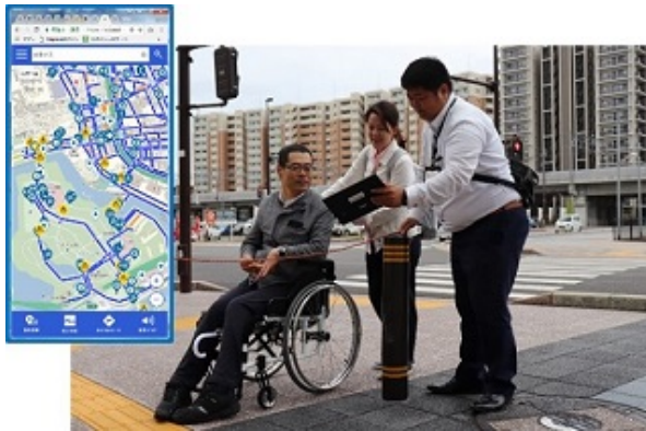
Helping create accessibility maps in collaboration with local government