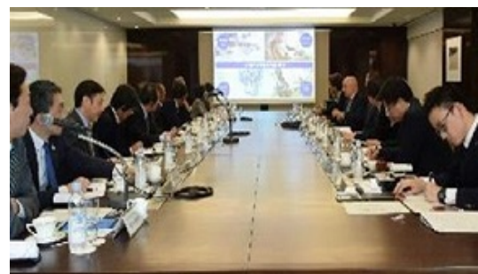
Round Table Meeting in Tokyo