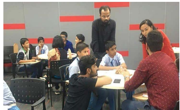
Scene of the class

We will continue our support to TFI and increase the level of employee participation in social activities to help students undergo transformational change in themselves, their classroom, school and community.