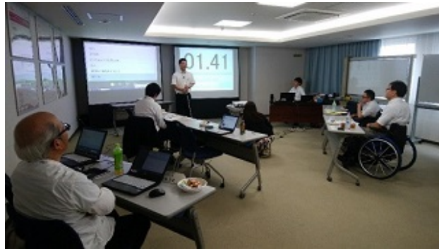
Barrier-Free Minds workshop to further mutual understanding

Visit the web page below for information on Fujitsu's sport-related initiatives