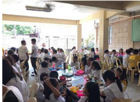
Scene of the school

Fujitsu Philippines GDC will continue to provide educational opportunities to the children by providing continuous support to the Makabata School Foundation.