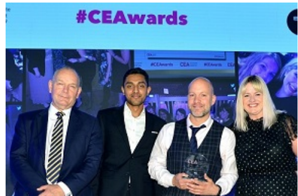
Corporate Engagement Awards ceremony

The project has had a revolutionary impact for the charity and all work to empower those living with cancer and their families, Macmillan volunteers and employees. This work was awarded silver recognition at the Corporate Engagement Awards, 2019.