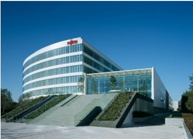
Fujitsu Solution square (Ota Ward, Tokyo)

The Fujitsu Group will continue its efforts to reduce greenhouse gas emissions and contribute to the Tokyo Metropolitan Government's efforts and the realization of a sustainable society.