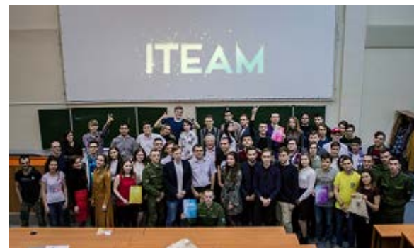
Participants of ITEAM Student Project Competition

The strong relationship between Fujitsu and the University through a series of these activities will open up the possibility of students taking internships and job roles at Fujitsu in the future.