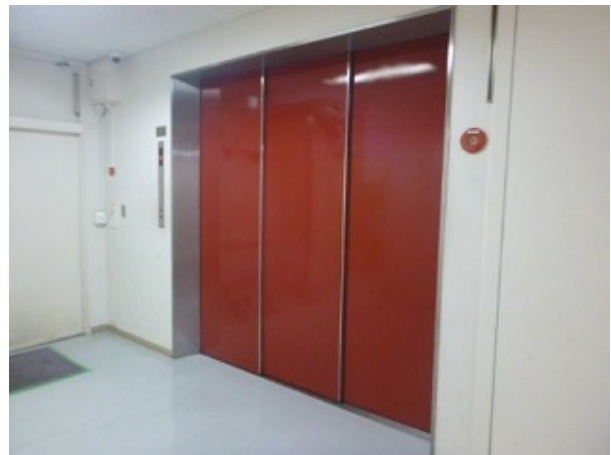
High-efficiency elevators (Fujitsu Solution square)