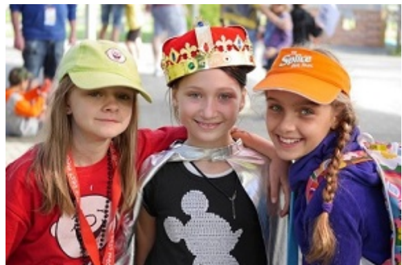
Participants of Camp Quality

Our support equates to over $100K each year, $27K donation+ in kind support + fundraising.