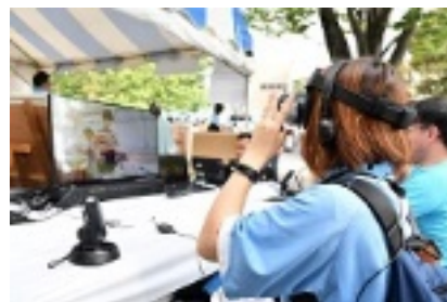
Experience outside the stadium