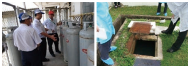
An internal audit being conducted overseas

Overseas, receiving cooperation from external experts thoroughly knowledgeable in local laws and regulations and operation, we carried out internal audits with the objective of strengthening compliance.