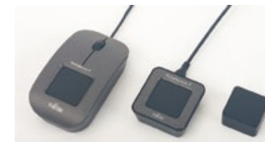
(L) PalmSecure-F Pro Mouse (C) PalmSecure-F Pro Standard (R) PalmSecure-F Pro (for embedding)

The PalmSecure-F Pro lineup uses a CMOS sensor with a higher frame rate* than the previous device, features a new current driving circuit, and shortens output of LED current (quickens shutter speed). By also capturing fewer frames during the imaging process, it cuts power consumption by 80% per authentication.