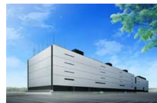
Data center (Tatebayashi)

The Technology Solutions segment provides corporate customers around the globe with IT-driven business solutions based on our advanced technology and high-quality system platforms and services.