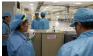
An internal audit being conducted overseas

And overseas, receiving cooperation from external organizations and experts thoroughly knowledgeable in local laws and regulations and operation, we carried out internal audits with the objective of strengthening compliance. As a result, regarding the content of the findings, some 40 percent related to "legal and other requirements" and "operational control."