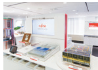
Fujitsu Trusted Cloud Square