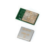
Bluetooth® low energy module

The Device Solutions segment provides LSI devices for digital consumer electronics, automobiles, mobile phones and servers, as well as semiconductor packages and other electronic components. The segment also offers electronic components, such as batteries, relays and connectors.