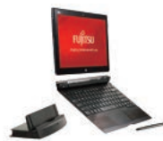
ARROWS Tab QH77

The Ubiquitous Solutions segment is involved in the development, manufacture and sale of PCs and mobile phones, as well as audio and navigation equipment and other types of mobilewear.