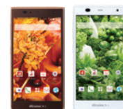
ARROWS NX F-05F