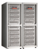
Fujitsu SPARC M10 UNIX Server

The Technology Solutions segment provides corporate customers around the globe with IT-driven business solutions based on our advanced technology and high-quality system platforms and services.