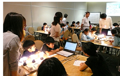
Kawasaki Science Challenge in Kawasaki City, Kanagawa Prefecture