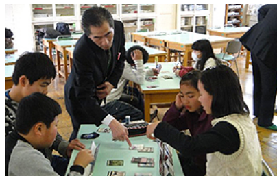
Hachioji Miyakami Elementary School in Hachioji City, Tokyo (My Earth)