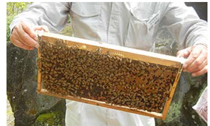
Fujitsu Coworco Ltd. Honey Smile Project

In FY 2011, Fujitsu Coworco Ltd. began its Honey Smile Project, aimed at addressing the falling honeybee population by increasing the number of cultured bee colonies while giving due consideration to biodiversity. This project involves growing milkvetch and other flowers which provide important sources of nectar needed by honeybees for pollination, building and placing hives adjacent to the plantings. Through this effort, honeybees carry the pollen back to the hive, while also helping to pollinate the flowers. The fruits and seeds that result become food for small animals, and their droppings then provide nutrition for a wide variety of plants and animals, creating a cycle of life that repeats and forms an ecosystem. Our abundant lives are made possible by the bounty of nature, and as part of its role as a corporate citizen, Fujitsu will continue to contribute to society through these kinds of activities.