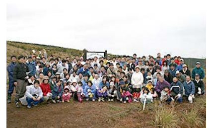
Clearing Underbrush in the FJQS Fureai Forest

As part of its contribution to the local Kyushu community, in 2004 Fujitsu Kyushu Systems (FJQS) established a 10-year plan to work with Aso Green Stock, a public-interest foundation, to plant, maintain, and preserve forest land. By 2008, the FJQS Fureai Forest was completed, with 15,000 trees planted across 7.8 hectares. Currently, under a plan running through 2012, the project focuses on clearing underbrush as part of the management and preservation phase.