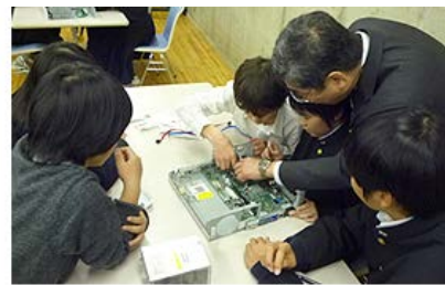
Ochiai Junior High School in Shinjuku-ku, Tokyo