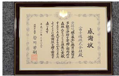
Photo of the certificate