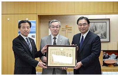
Photo commemorating the certificate