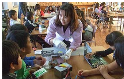
Tadonaka Elementary School in Kuwana City, Mie Prefecture (PC recycling)