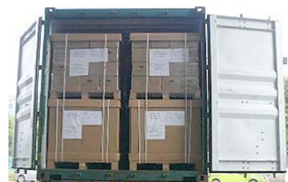
Loading a container

Fujitsu Ten Ltd. uses a loading method that effectively utilizes container space by standardizing previously irregular sizes of outer packaging for international transport between Group companies and for procured materials. This initiative was then extended to shipments originating with overseas suppliers, which has served to further reduce the number of containers used.