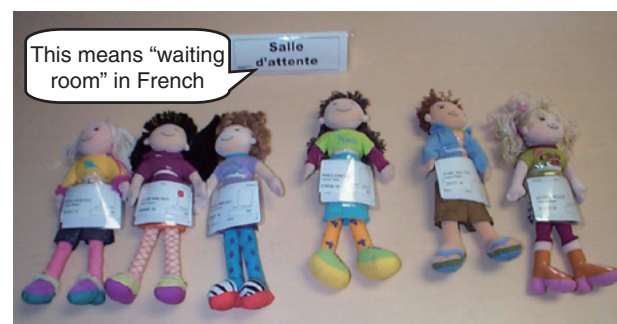
Figure 3 Fujitsu Lean Healthcare ER simulation patients.

With respect to the marketing strategy, in addition to creating promotional documents for introducing Lean Healthcare, the Fujitsu Lean Healthcare team of certified Lean and Lean Six Sigma engineers has developed a one-day Lean Healthcare training session that incorporates a powerful simulation of an ER to illustrate key Lean Healthcare principles ( Figure 3 ). Besides making it easier to understand the Lean approach, the simulation allows managers and professionals in the healthcare sector to understand, in just a few hours, the effectiveness, added value, and potential of applying the Lean Healthcare approach within a familiar setting.