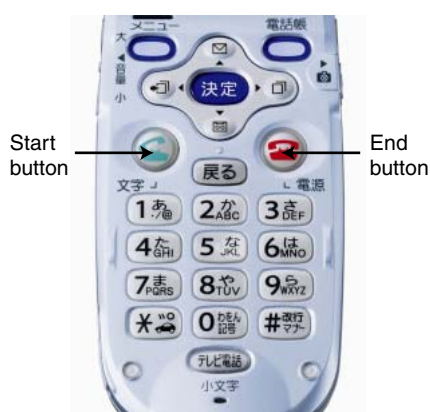
(a) Easy-to-use and easy-to-find buttons