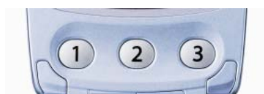
(c) One-touch dialing buttons