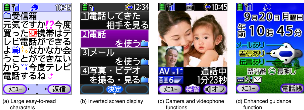
Figure 5 Operation screens of Raku Raku PHONE.