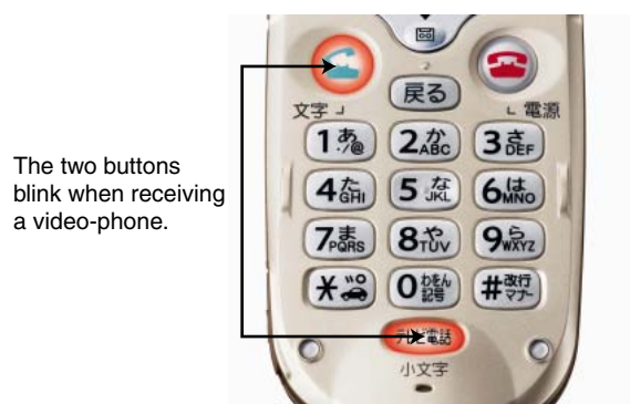
(b) Light navigation feature