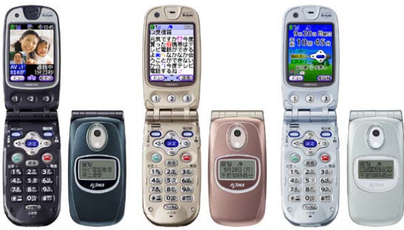
note) From left: dark green, bronze, and silver. Pink was added in February 2005.