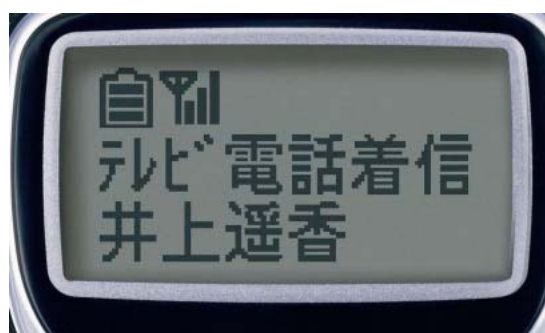
Figure 4 Rear sub-display.

The sub-display on the back is of a landscape 1.2-inch monochrome type (STN monochrome LCD) that can show large characters and is easy to read even when the backlight is off due to time-out ( Figure 4 ). The high contrast set between displayed characters and the background enhances visibility.