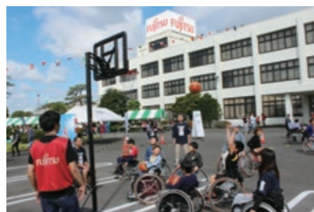
A wheelchair basketball workshop

As part of its activities to benefit local communities, the Fujitsu Group hosts a wide variety of events for local residents, employees, and their families. For example, Fujitsu-affiliated athletes conduct sports experience events aimed at promoting health and enhancing children's athletic ability. In recent years, Fujitsu-affiliated Olympians have participated in meet-and-greet events designed to build momentum in the run-up to the Tokyo 2020 Olympic and Paralympic Games. With a view to promoting understanding of disabilities as well as increasing the popularity, broadening the base, and furthering appreciation of para-sports, we have also invited para-athletes who compete in various regions to facilitate para-sports experience events.