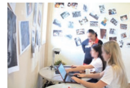
Scanning process for the digital archive

In Australia, we have provided our ScanSnap technology and a cloud hosting service to the Bawurra Foundation, which preserves Aboriginal and Torres Strait Islander knowledge and culture for future generations through the digital archiving of cultural treasures. In this way, the Fujitsu Group will support the passing on of indigenous peoples' cultural values, customs, and philosophy.